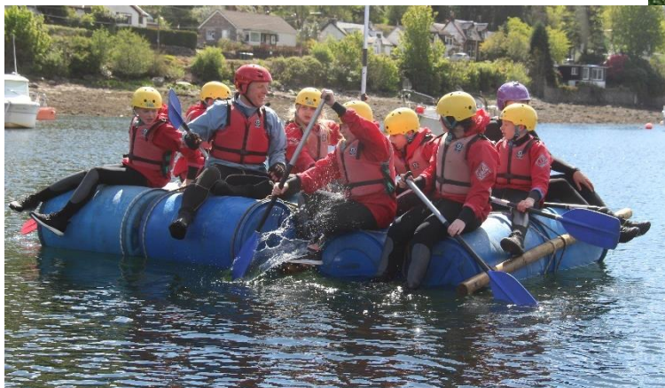
Crash of the Scouts rafts on Loch Gail See inside for more of their adventure weekend