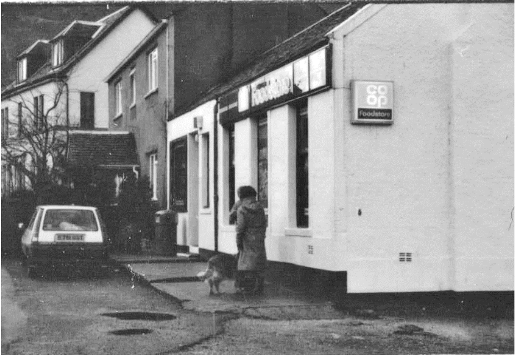
Above: The old Co-op opposite Fern Villa; Below: The Milk Bar in West Laroch