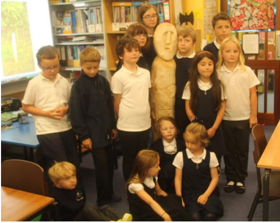
Duror School (above) and the younger pupils at Glencoe (right) also welcoming their oldest new pupil!