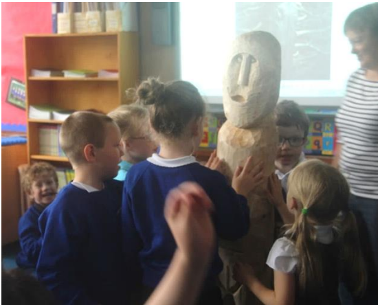
Below & left: All of the schools were allowed hands on with the Goddess, and here we see Ballachulish pupils getting up close and personal!