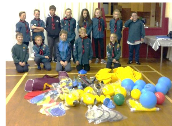
New equipment for the Scouts, thanks to the Co-op