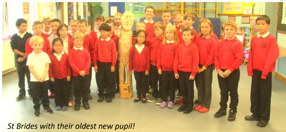
St Brides with their oldest new pupil!